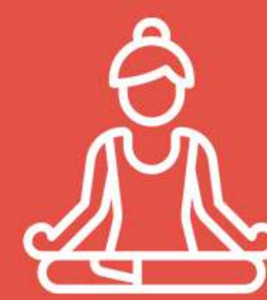
Yoga & Meditation Park