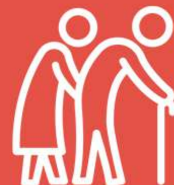
Senior citizen Park