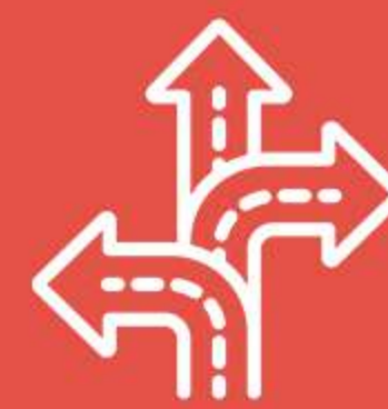
High Street Retail